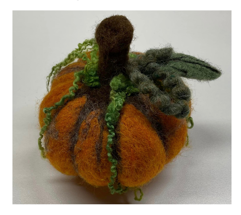
Pumpkin: October 5th