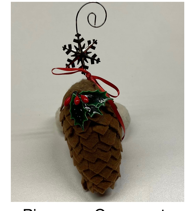
Pinecone Ornament: November 2