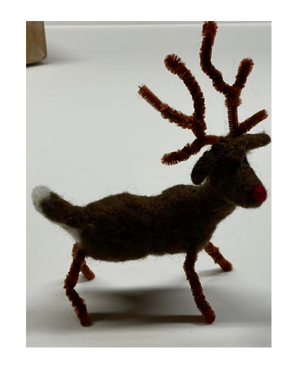
Reindeer: December 7th

Follow us on...willingtonpubliclibrary.org, WPL's E-Blast, Facebook, Instagram, Twitter, Youtube, & burbio.com